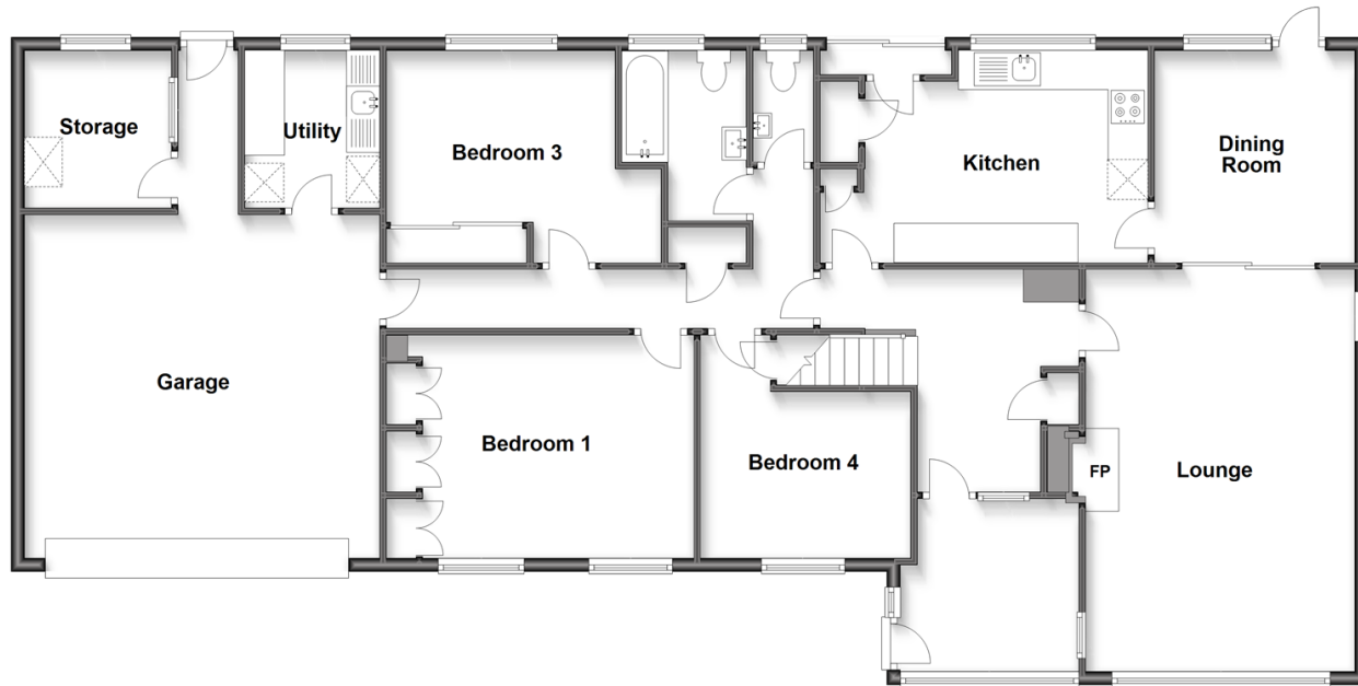
Ground Floor Approx. 165.5 sq. metres (1781.5 sq. feet)