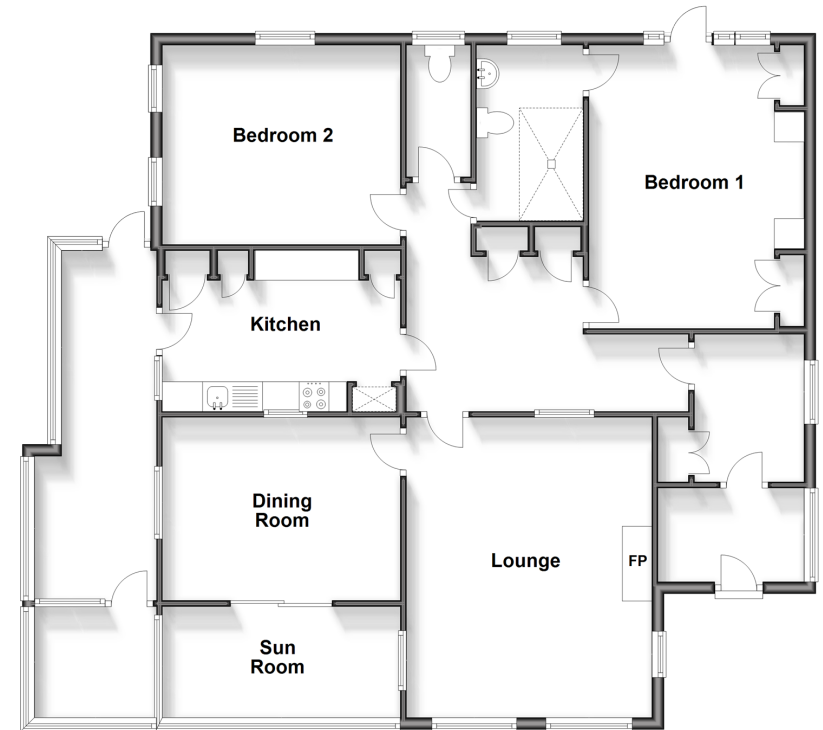
Ground Floor Approx. 130.3 sq. metres (1402.9 sq. feet)

Call West Worthing - 01903 700657 ■ cubittandwest.co.uk