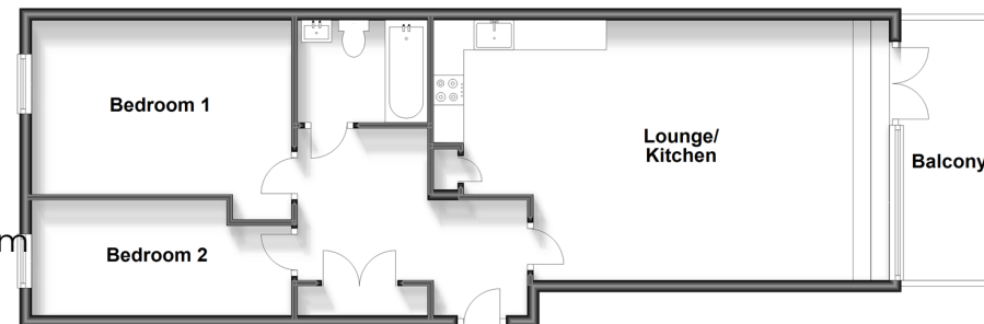
First Floor Approx. 66.8 sq. metres (719.5 sq. feet)

Call West Worthing - 01903 700657 ■ cubittandwest.co.uk